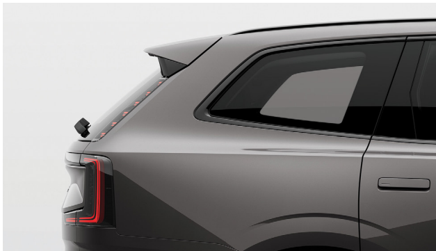
Platinum Grey Metallic