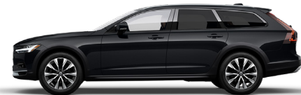
V90 Cross Country