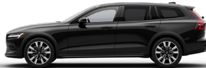
V60 Cross Country, V60 Polestar Engineered