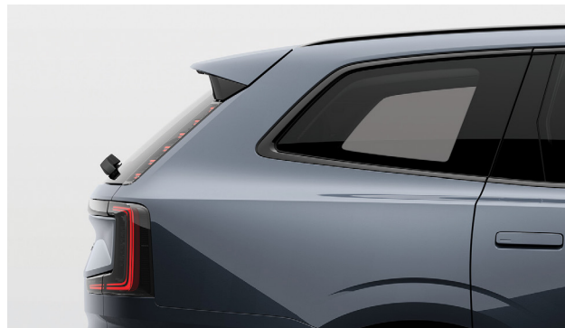
Denim Blue Metallic