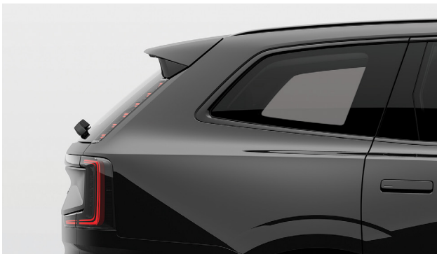
Onyx Black Metallic