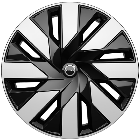
21" 8-Spoke Aero Wheel Standard on Ultra Optional on Plus