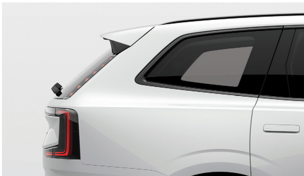
Crystal White Metallic