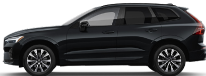
XC60, XC60 Polestar Engineered