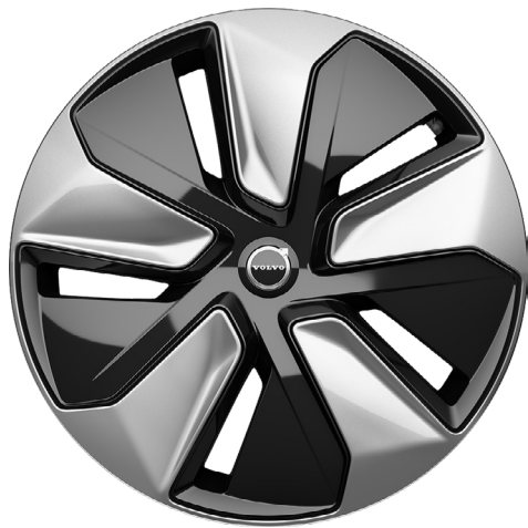
20" 5-Spoke Aero Wheel Standard on Plus