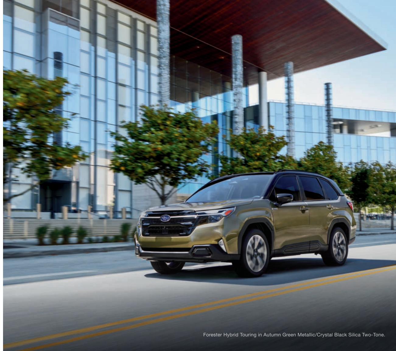
Forester Hybrid Touring in Autumn Green Metallic/Crystal Black Silica Two-Tone.

With exclusive hybrid badging, black roof paint 2 and standard 18-inch wheels, the Forester Hybrid stands out from the rest of the line-up.