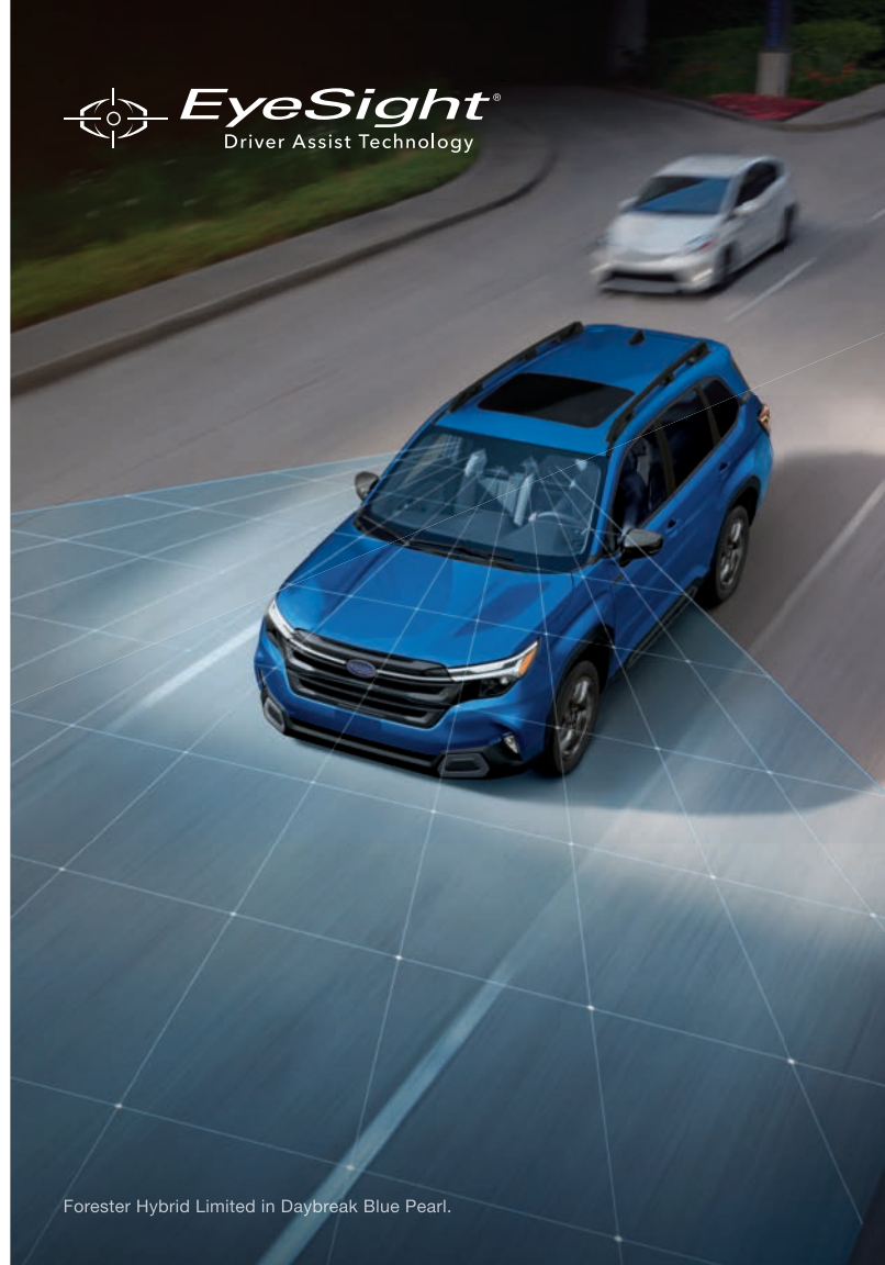
Forester Hybrid Limited in Daybreak Blue Pearl.