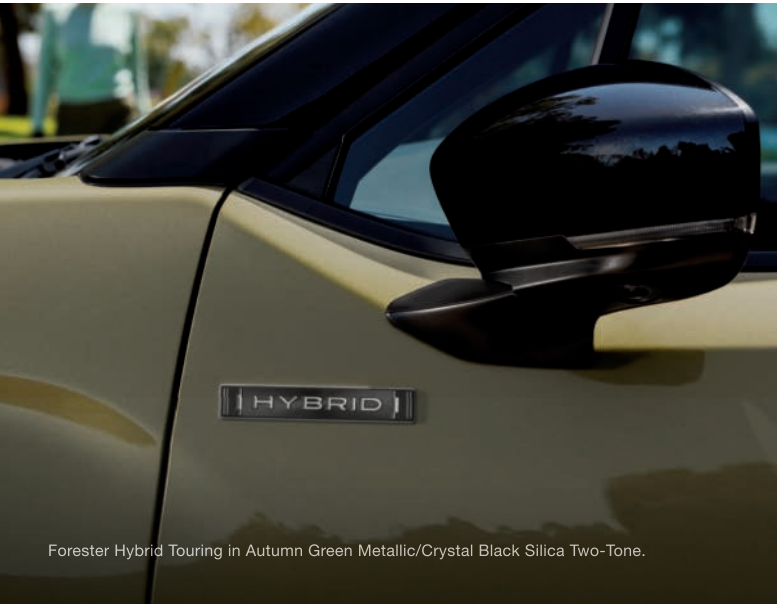
Forester Hybrid Touring in Autumn Green Metallic/Crystal Black Silica Two-Tone.

The Subaru Hybrid Drive System seamlessly blends the reliable power of the SUBARU BOXER® engine with an advanced electric motor, delivering the perfect mix of gas and electric power for every drive. Most journeys will use both motors, with the BOXER engine recharging the electric battery through regenerative braking or during low-demand situations. And when the opportunity arises, the Forester Hybrid automatically switches to all-electric mode, maximizing efficiency. With this advanced hybrid technology, the Forester Hybrid offers up to 581 miles on a single tank—up to 10 more miles per gallon than the traditional Forester. 1