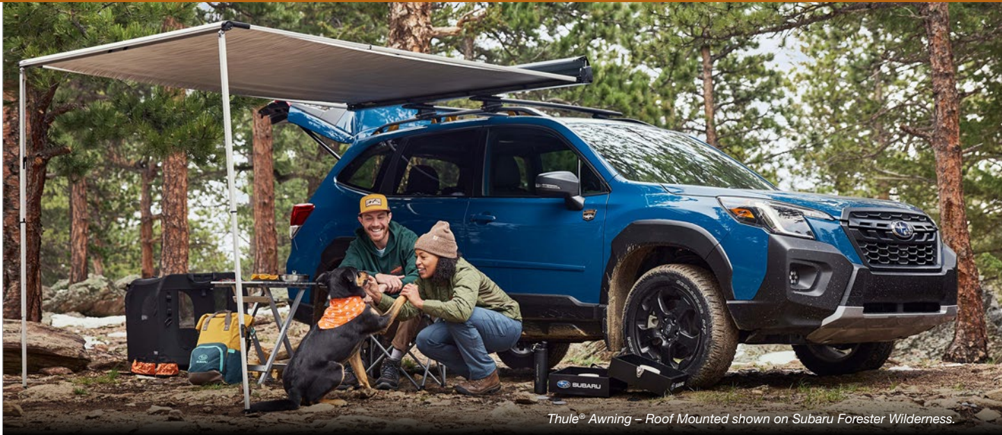
Thule® Awning – Roof Mounted shown on Subaru Forester Wilderness.