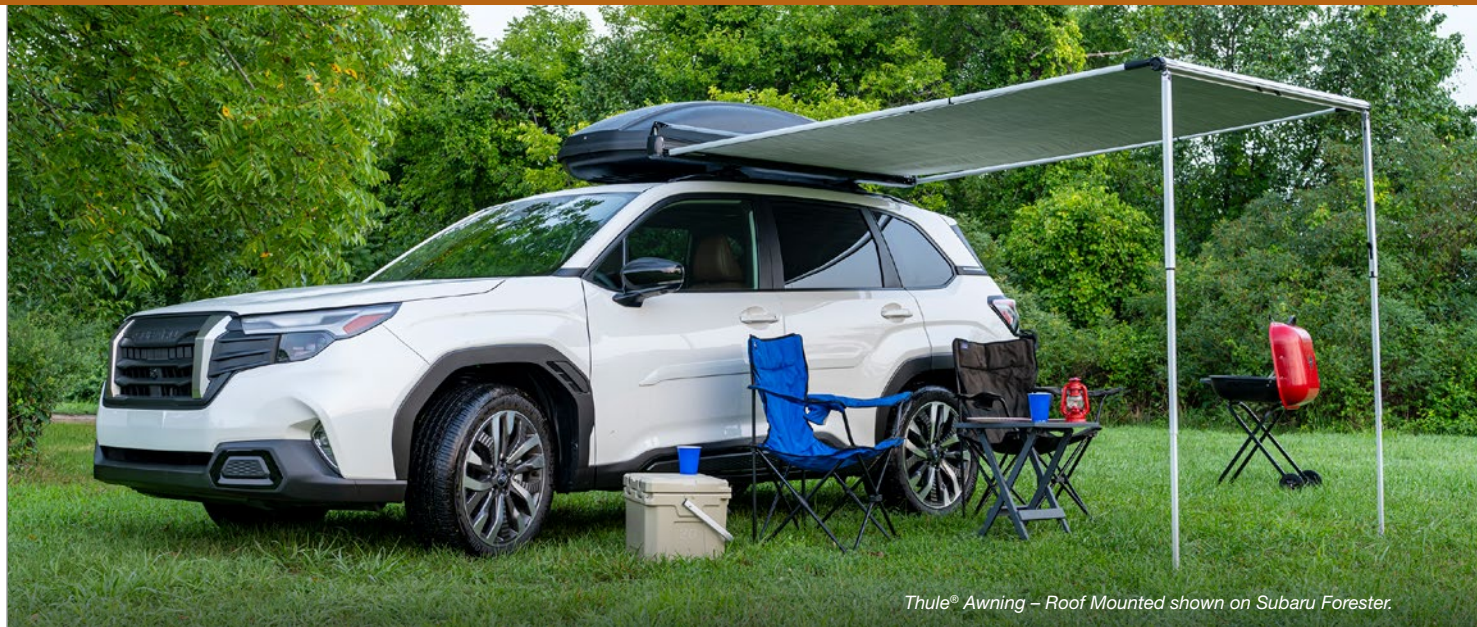
Thule® Awning – Roof Mounted shown on Subaru Forester.