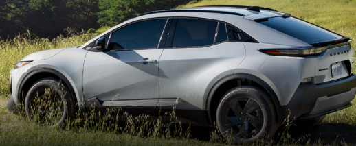
Subaru Uncharted Sport in Metropolis Gray Metallic.

Explore without limits—enjoy easy access to more than 25,000 Tesla Superchargers across North America.