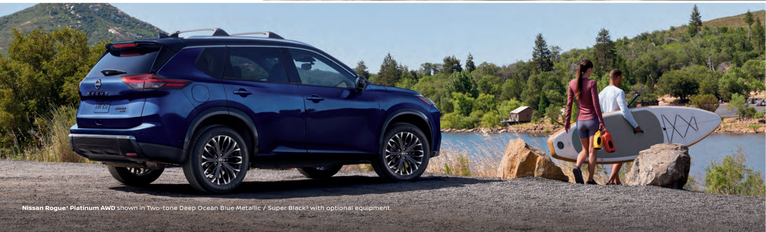
Nissan Rogue® Platinum AWD shown in Two-tone Deep Ocean Blue Metallic / Super Black 5 with optional equipment.