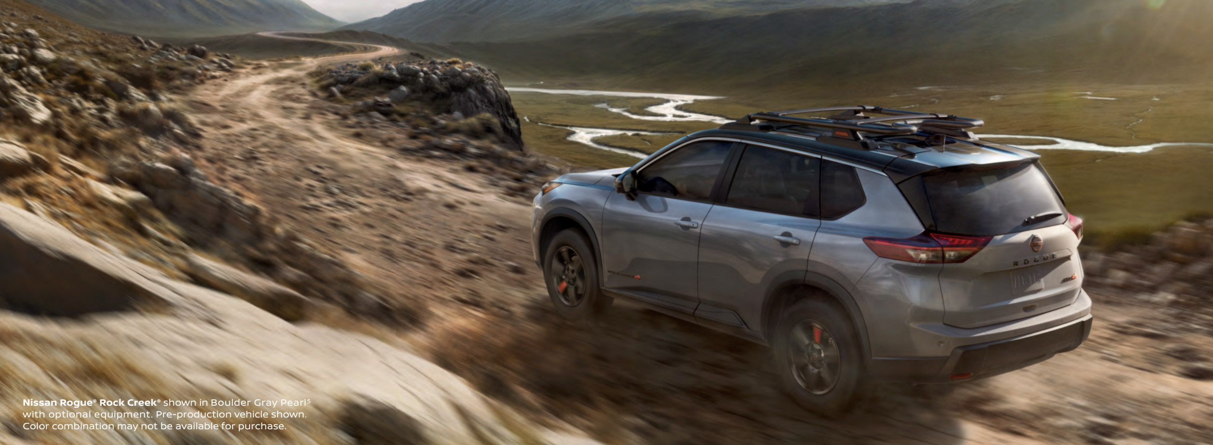
Nissan Rogue® Rock Creek® shown in Boulder Gray Pearl 5 with optional equipment. Pre-production vehicle shown. Color combination may not be available for purchase.

In the new Rogue Rock Creek, adventure is a philosophy to live by. Equipped with an impressive checklist of features, including an HD Intelligent Around View® Monitor with Off-Road Mode, 11 black tubular roof rack, 1 17" dark-painted aluminum-alloy wheels with all-terrain tires, and more, Rock Creek takes you from the indoors to the outdoors, in style and confidence.