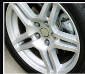
Aftermarket Wheels with no Surcharges