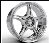
Cosmetic Damage to Chrome/Chrome Clad