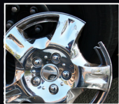
Cosmetic Damage to Hubcaps