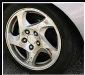
Cosmetic Damage Wheel Replacement