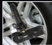
Tire Pressure Monitoring Sensors