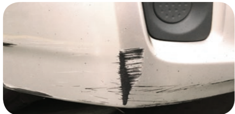
Damaged bumpers, body dents, dings or scratches