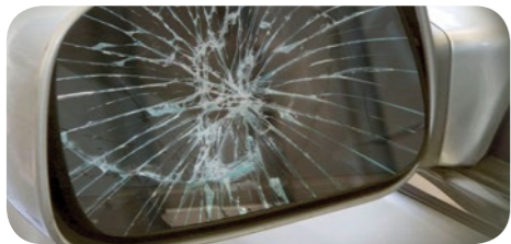
Broken or scratched windshield, windows, mirrors or lights