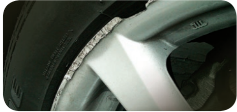
Damage to tires, rims or hubcaps