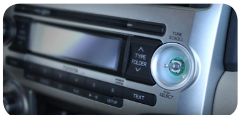
Missing parts or equipment